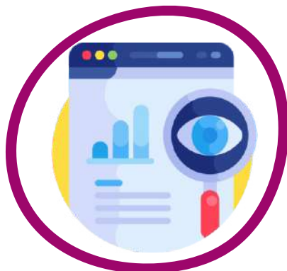
Digital Records Management