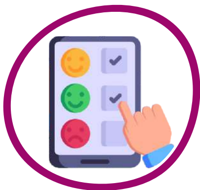
Transparent Selection Process