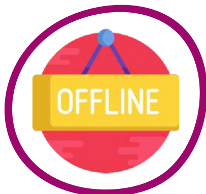
Offline Application Process