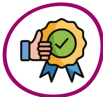
For All Participants