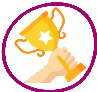
Renowned Trust in Educational Field