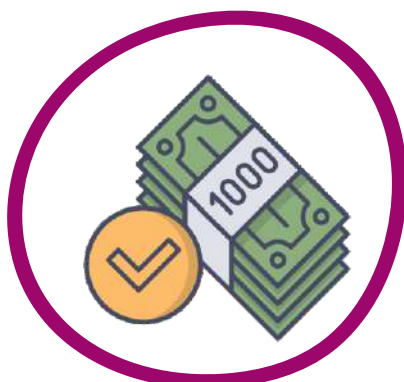
₹ 25,000/- ₹ 10,000/- Nomination Fees