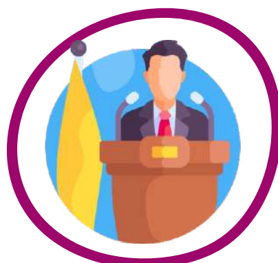
Award distribution by national-level VIPs and social personalities